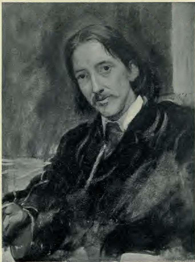
ROBERT LOUIS STEVENSON.

From the Painting by Sir William Blake Richmond, K.C.B., R.A.